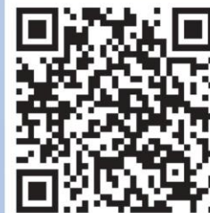
Ekal: Azadi ka Amrit Mahotsav